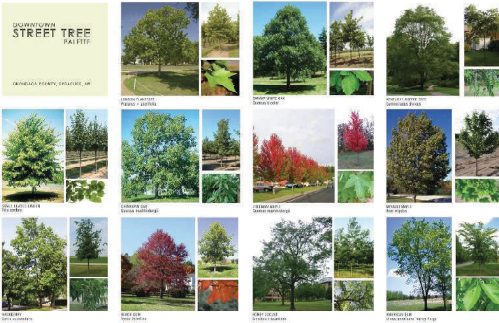
Street Tree Palette