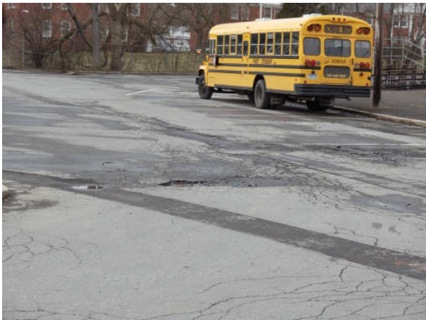
Conditions Prior to Green Project