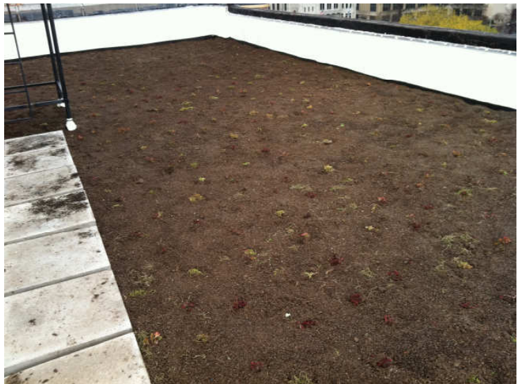
Green Roof Planting

The Putnam green roof is estimated to capture approximately 81,000 gallons annually and will act as a demonstration project in the Downtown corridor with sections of the roof visible to occupants of the HSBC Building, the Hills Building, One Park Place and Lincoln Center.