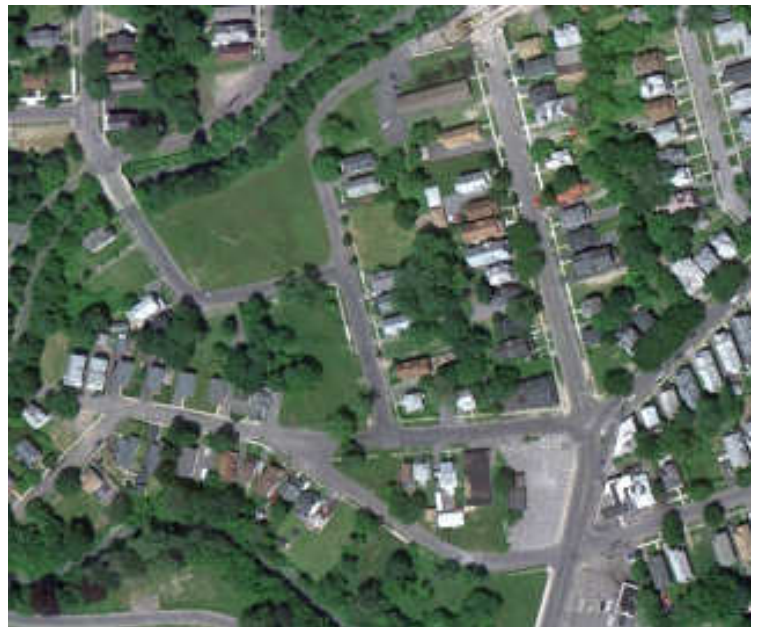
Aerial Imagery of CSO 045 Prior to Construction of Gray Save the Rain Project and Associated Greening

The rooftop of the building that is being disconnected has an area of approximately 4,000 sq. ft., which equates to an annual stormwater capture and runoff reduction of 69,000 gallons per year.