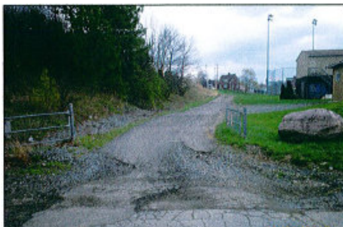
Town Hall Parking Lot before Porous Pavement Was Installed