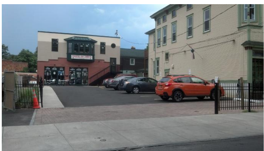
New Parking Area with Porous Pavers for the Taste of India Restaurant