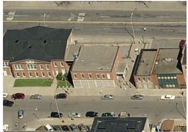
Erie Canal Museum Before Green Roof