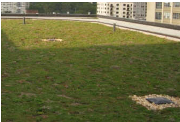
Example of Green Roof Implementation

The Erie Canal Museum stormwater retrofit project features the installation of a green roof on one of the main buildings at the Erie Canal Museum and Visitor Center. The green roof will feature plantings in a lightweight growing medium on top of a waterproof membrane designed to capture stormwater, irrigate plantings, and allow excess stormwater to evapotranspire which will ultimately prevent stormwater from leaving the rooftop and entering the combined sewer system.