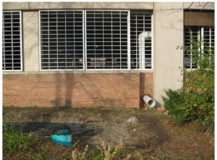
Construction of a Rain Garden at the OnCenter Garage with Downspout Draining into It