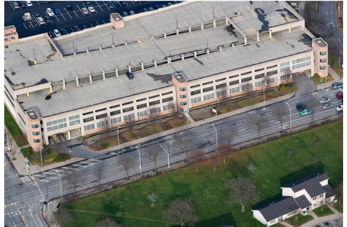
Aerial View of the OnCenter Garage under Construction (Facing North)