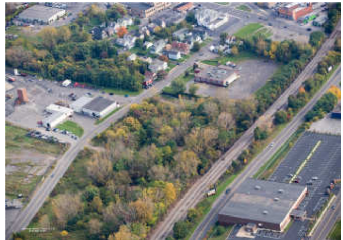
Aerial Photograph of Harbor Brook Storage Prior to Construction of Storage Facility and Associated Green Work