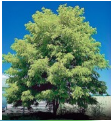
Example of a Honeylocust