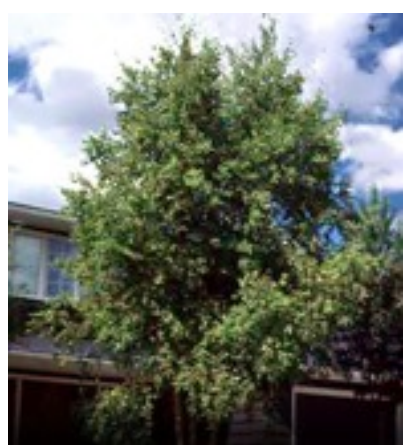
Example of a River Birch Tree

This planting is part of the ongoing efforts of the Save the Rain Urban Forestry Program. The program is developing a robust tree planting strategy for neighborhoods throughout the City of Syracuse. Over the life of the program, it will support the