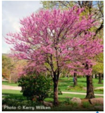
Example of a Redbud