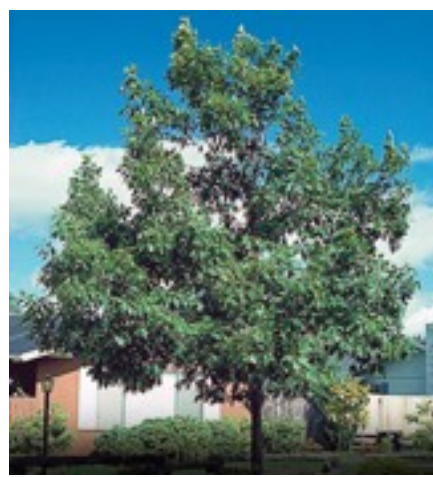
Example of a Red Oak