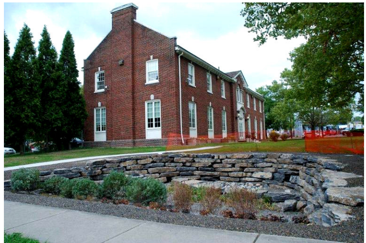
Completed Bioretention Area at White Library

Another green improvement at White Library was the removal of excess pavement in the parking lot, and the installation of a new infiltration trench to capture stormwater runoff from Peters Street. These green improvements contribute to a reduction of 427,000 gallons of stormwater from entering the combined sewer system annually.