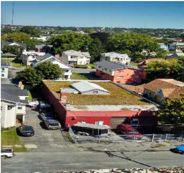
Aerial View of Completed Green Roof System

Approximately 4,126 square feet of green infrastructure was installed that will capture an estimated 102,700 gallons of stormwater annually.