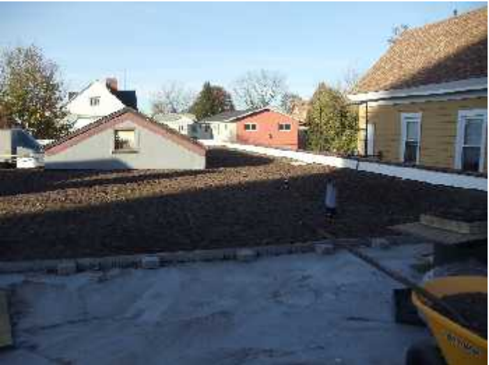
Construction of Green Roof System