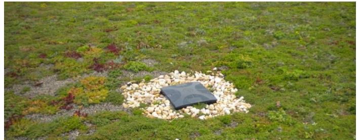
Example of Green Roof Implementation

In total, the Spa at 500's Green Roof captures approximately 98,600 gallons annually.